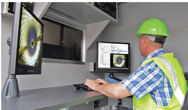
BoreOptix works with Aries' mobile and vehicle-mounted inspection systems.

BoreOptix integrates seamlessly with Aries systems. It includes one-year free technical support.