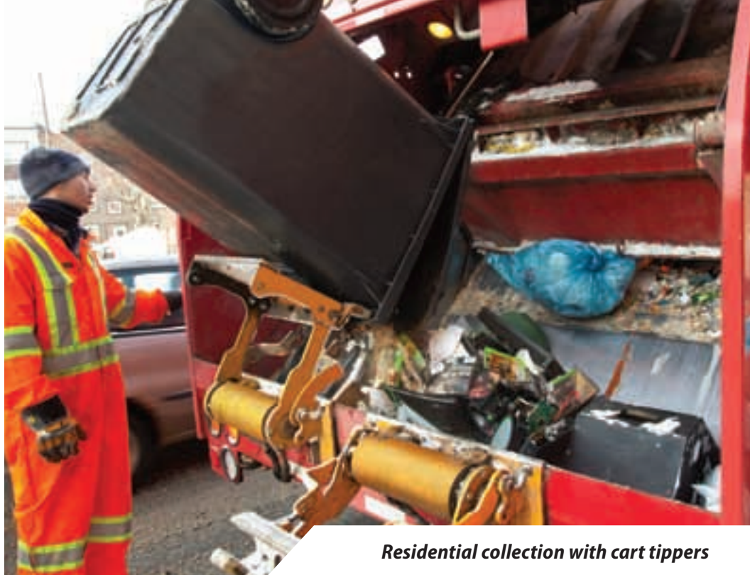
Residential collection with cart tippers