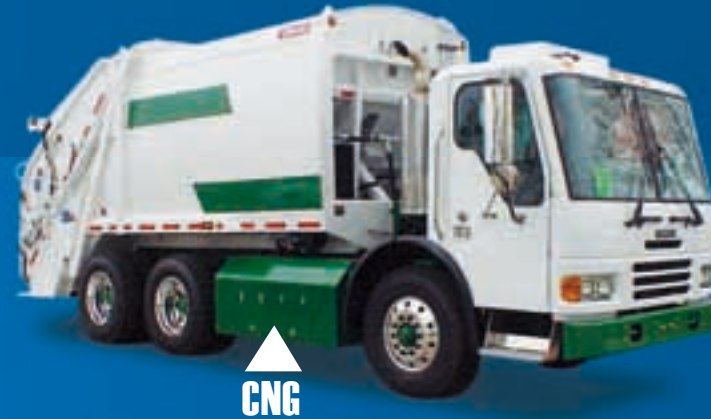
Leach Alpha-III™ / chassis mounted configuration

With the high volatility of diesel prices, fuel choice has never been more important. At Labrie, we believe in greener, safer, smarter and more efficient waste collection vehicles. This is what we have been designing and building for the past 25 years.