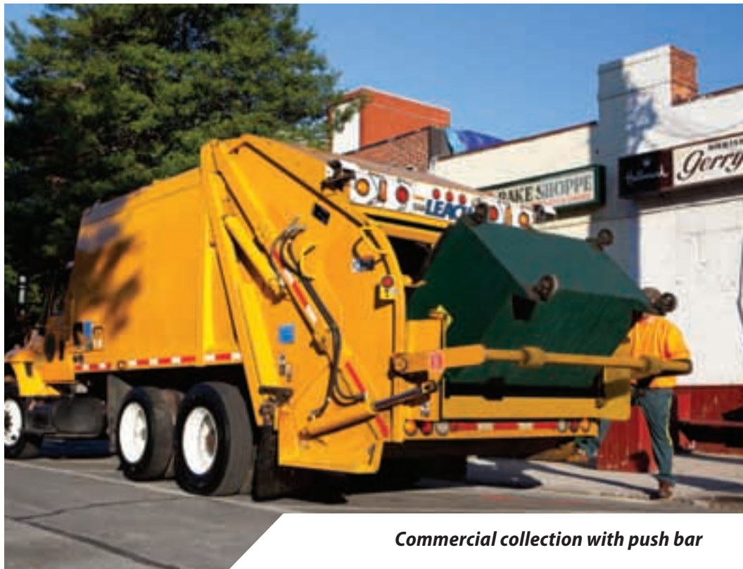
Commercial collection with push bar