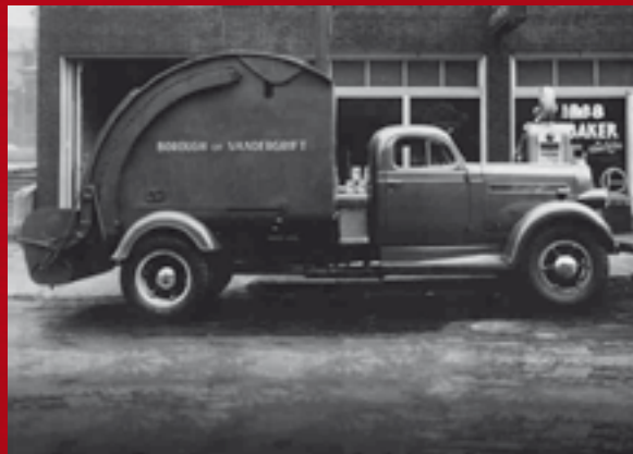
1932 Leach™ model 6R Refuse Getter

This story of two forward-thinking hard workers is what brought Leach™ to the forefront of an industry still in its infancy. With a reputation for innovative, hard-at-work refuse trucks, Leach™ became and still is today, the standard by which all others are measured.