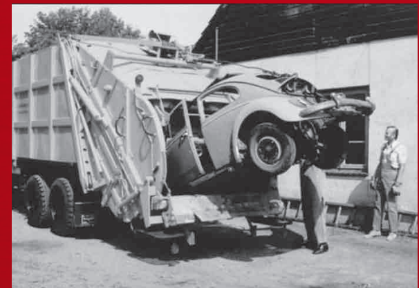
1960 Leach™ 2R