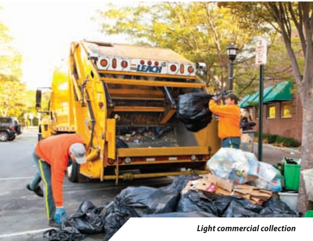
Light commercial collection