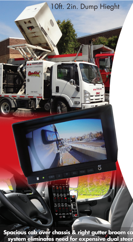
10ft. 2in. Dump Height

From chip seal and milling operations to heavy spring clean-up, the Stewart-Amos Sweeper Co.'s Starfire S-4 can handle it.