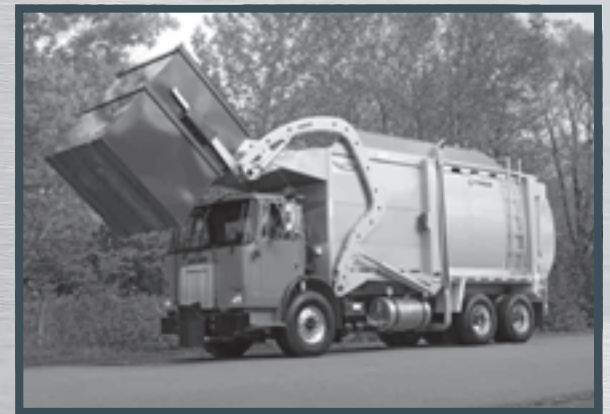
2005 Labrie Optimizer™