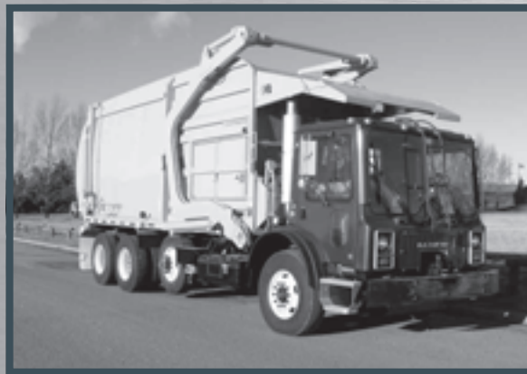
2003 Wittke Starlight™