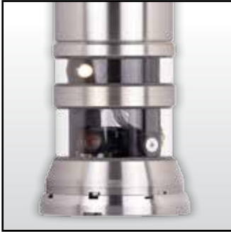
Unique pan and tilt camera movement provides superior well casing examination