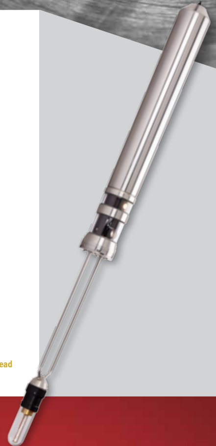
BT9700 camera with LED lighthead