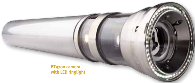
BT9700 camera with LED ringlight

The camera's single-module design allows it to tilt off-center and zoom in both views. This unique operating benefit produces clear, quality images to more accurately evaluate difficult conditions.