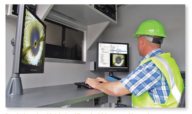
BoreOptix works with Aries' mobile and vehicle-mounted inspection systems.

BoreOptix integrates seamlessly with Aries systems. It includes one-year free technical support.