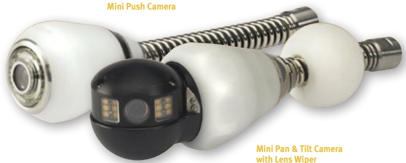
Mini Push Camera

A centered push cable on the underbody of the tractor maximizes cable bending for easier launching. The open drive system is self-cleaning, eliminating sludge build-up for maintenance-free operation.