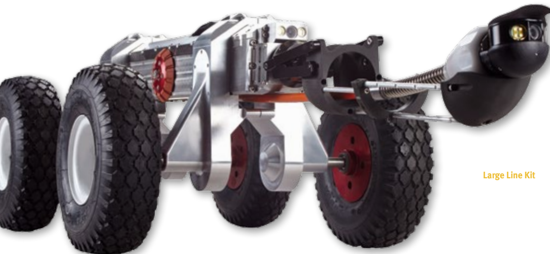
Large Line Kit

LETS 6.0 is operated by the Aries Master Controller, providing remote operation using a dual joystick Xbox 360® controller, for ease-of use and improved maintainability. The system also works with legacy controllers.