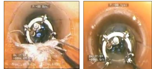
Minimal residual grout ring remaining