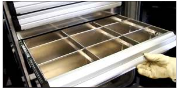
ONE CLICK locks the drawer open!