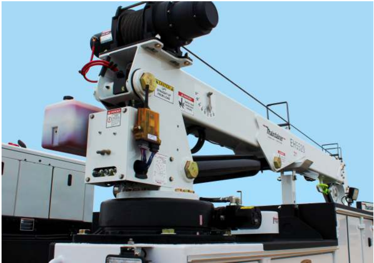
Crane shown is EH520