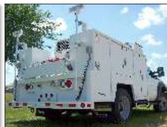
Public Road Side Assistance