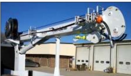
Boom Tip Hydraulics