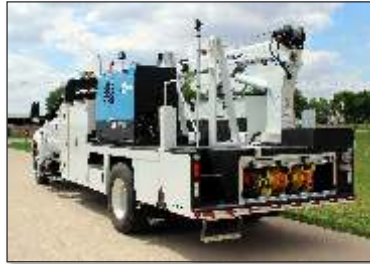
City Road Plate Maintenance