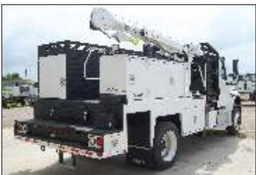
Sign Maintenance Truck