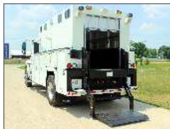
Enclosed Service Body With Lift Gate