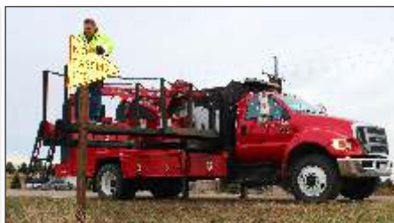
Hydraulic Catwalks for easy access