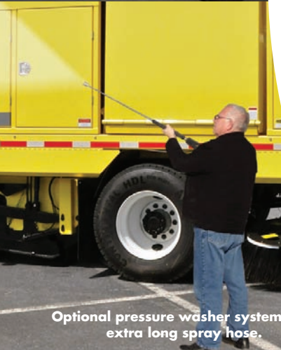
Optional pressure washer system with extra long spray hose.

Stewart-Amos Sweeper Co.'s Starfire Sweeper Series - The Powerhouse in Broom Sweepers