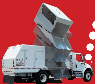
12ft. 2in. Dump Height Camera System